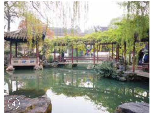
Images: 1. Forbidden City, 2. ERA: The Intersection of Time, 3. The Bund, 4. Lingering Garden, 5. Jin Mao Tower Observation Deck, 6. Terracotta Army, 7. West Lake, 8. The Golden Mask Dynasty, 9. Giant Panda, 10. Impression West Lake, 11. City God Temple, 12. Ancient City Wall

This morning visit a silk spinning mill, and learn how silk is created from mulberry-munching silkworms to produce the finest thread and cloth. After lunch, travel by coach to Hangzhou, described by Marco Polo as "the most beautiful and magnificent city in the world". Upon arrival, take a boat ride on the serene West Lake , the most renowned feature of Hangzhou, and noted for its scenic beauty which blends naturally with many famous historical and cultural sites. This evening, you can enjoy an optional open-air performance, Impression West Lake (at your own expense), a masterpiece created by Zhang Yimou, the director of the 2008 Beijing Summer Olympics Games Opening Ceremony.