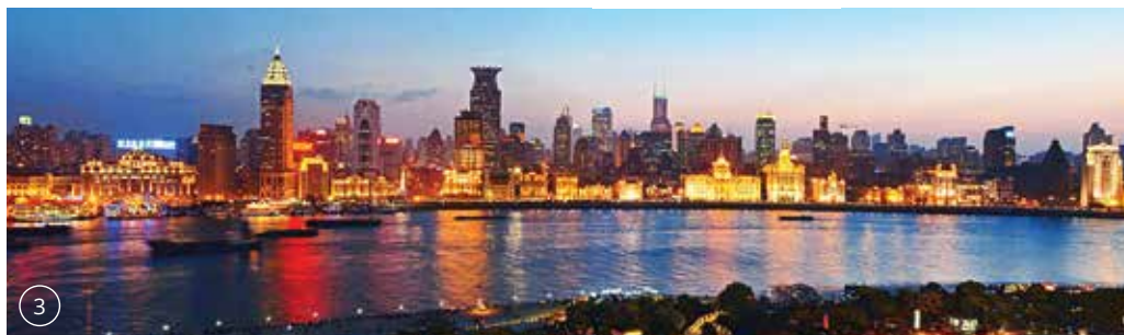
Images: 1. Wuzhen water town, 2. Xingping River Cruise, 3. The Bund, 4. Summer Palace, 5. Chinese acrobatic show, 6. Terracotta Army, 7. Old Town Shanghai, 8. Chengdu Research Base of Giant Panda Breeding, 9. Lingerin Garden, 10. Great Wall